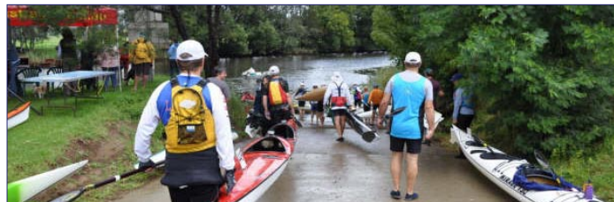
"Competitors get ready"